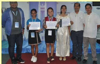
Clubs Collective Action Towards a Peaceful and Just Society held at Icon Hotel, Quezon City on September 1.

The University now. Tomorrow, the world.