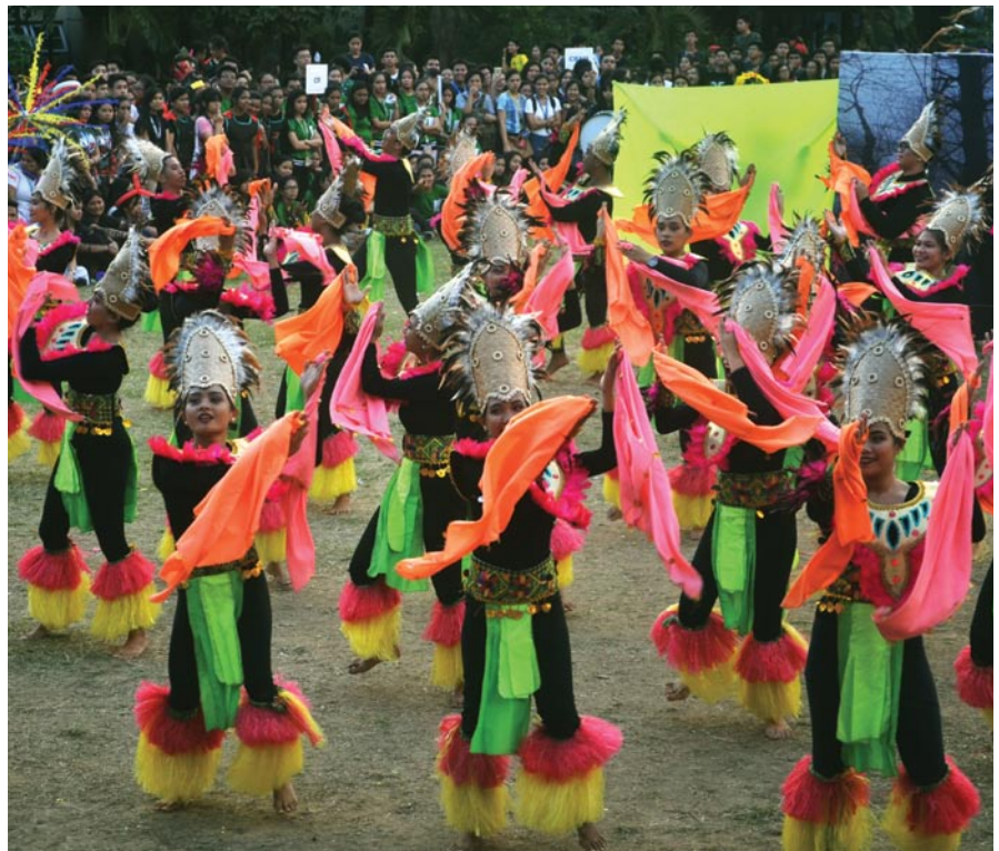
FESTIVAL OF COLORS. Colorful field demonstrations sends PLM's Golden Anniversary celebrations to a rocking start. More photos on pages 4-5

Soon after the mass, the 10 participating squads, led by their team muses who were clad in elegant costumes that displayed the icons of the festival they represented, paraded around the Intramuros area. The members of the teams gamely danced to the music of the Ramon Magsaysay High School Marching Band to the delight of an enthusiastic crowd composed of students, PLM officials, management and staff, tourists and office workers in the area.