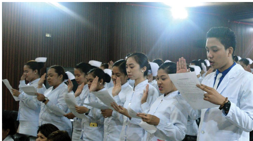
NEW NURSES. PLM College of Nursing graduates who passed the November 2016 board exams take their oath to formalize their entry into the nursing profession.