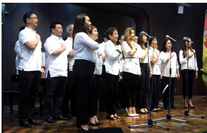
MAIDEN PERFORMANCE. The PLM Executive Chorale sings the national anthem to formally open the music recital held last February.

The music recital commenced with four featured flutists, all mentored by Philippine flute music icon