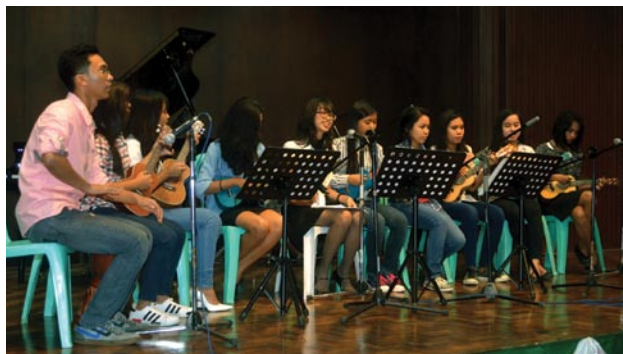
UKULELE ENSEMBLE. PLM students who took advantage of the free ukulele lessons offered by the Conservatory of Music show off what they learned from their tutor.