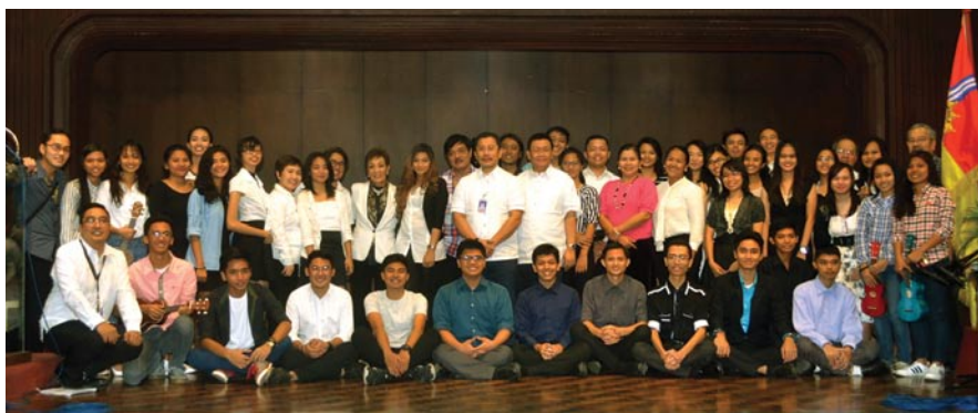
FIRST RECITALISTS. The first batch of graduates of the free music lessons offered by the PCACS Conservatory of Music pose with top university officials and their mentors.